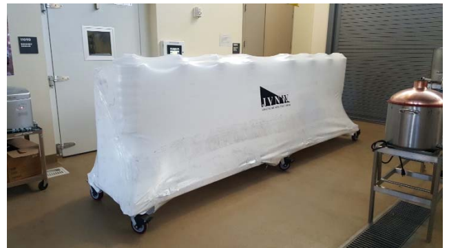
Unwrapped – blank slate!

First skid inside – starting to get a feel for the overall size. Each skid is 14 feet long.